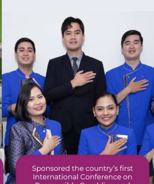
Sponsored the country's first International Conference on Responsible Gambling and Gaming Addiction