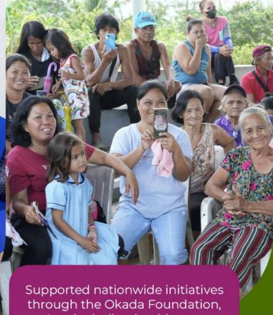
Supported nationwide initiatives through the Okada Foundation, Inc., including healthcare, education, and disaster relief