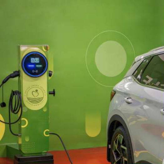
EV charging stations installed— first in Entertainment City